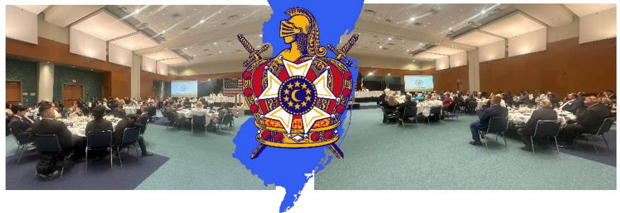
Well that's a wrap for Wildwood, NJ. (See Pictures Below)